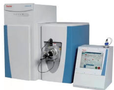
Q Exactive™ HF