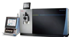
Orbitrap Fusion™ Lumos